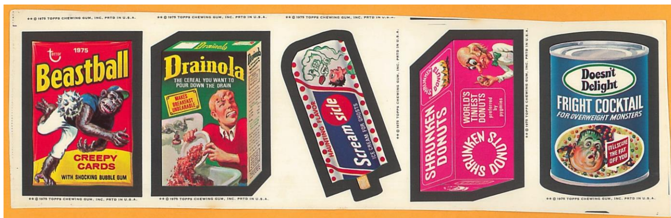
"Wacky Packages" 13th Series clear acetate stickers strip Image 03

The 13 th series of "Wacky Packages" were released around February/March of 1975 according to the wackypackages.org website, run by collector Greg Grant. Topps most likely printed these 13 th series acetate stickers from the same print sheet layout as the regular stickers, and probably around the same time or very soon after, if the same procedures took place as with the "Comic Book Heroes Stickers" acetates. Considering both these "Wacky Packages" and the "Comic Book Heroes Stickers", it is obvious Topps was experimenting with the clear acetate sticker stock, so it would be no surprise at all if other clear acetate issues (especially sports) eventually turn up. From my research, I've found Topps was tenacious when it came to experimenting and testing new ideas like cloth stickers, clear acetate stickers, size and format of cards and non-traditional novelty releases. They would try to use the new stock, size, format or novelty across both sports and non-sports releases in the hopes an issue would excel and be successful enough to fully release at retail.