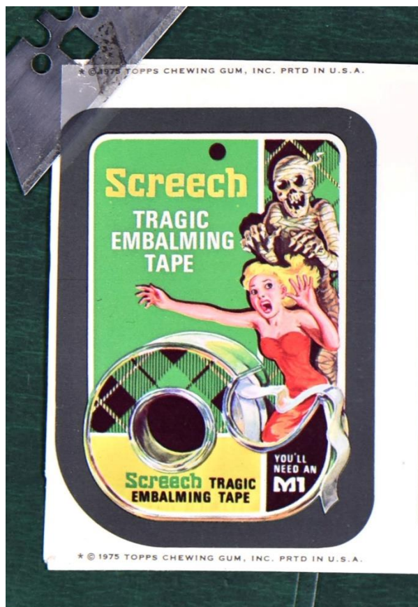
"Wacky Packages" 13th Series clear acetate white back sticker stock Image 03b

So, were these "Wacky Packages" 13 th Series clear acetate stickers ever tested? I have to assume they were indeed tested. Since both these stickers and the "Comic Book Heroes Stickers" clear acetate stickers originated from the Topps' Duryea plant, one can argue they were sent to the "Card Processing" department to be cut, collated and packaged for testing, otherwise, one would assume they would have gone to the Brooklyn office if they were just printed for proofing and review. We have no definite evidence of this for either issue however. I can envision Topps not die-cutting the stickers since the background was clear, but they did die-cut the "Comic Book Heroes Stickers" so it could go either way.