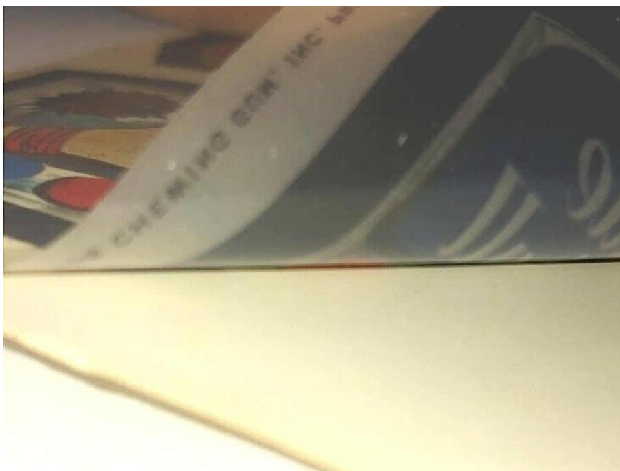
"Wacky Packages" 13th Series acetate sticker Image 02a

Recently, while researching other Topps' issues, and saving images I came across, I stumbled upon some recent eBay auctions from January and early February of this year which immediately caught my attention! The auctions all had similar titles of "1975 Topps Wacky Packages Uncut Strips (5) White Back Test Stickers". I was intrigued by the "test" keyword and took a look at the auctions. To my surprise, the stickers were clear acetate (Image 02a) with white back stock, just like the "Comic Book Heroes Stickers" mentioned above! The peeled back sticker is of "Battle Ball" (Image 02b). All of the auctions were from the same seller who described the stickers as "...part of a test run apparently which is why the stickers are sort of translucent...". He also went on to state, "I got these from a guy who worked at the factory back in the 60s 70s and 80s where they packaged all the Topps cards...". There were also a few other auctions in mid to late February, from a second seller, but I believe he was reselling strips obtained from the first seller. Taking all the auction results into consideration, the stickers averaged $13.69 per sticker, or $68.43 per strip of five.